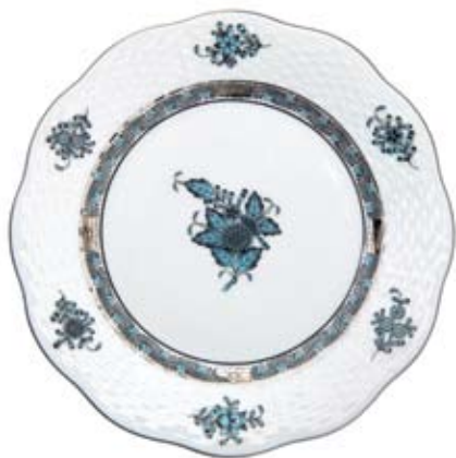
APPONYI TURQUOISE PLATINUM (ATQ3-PT)