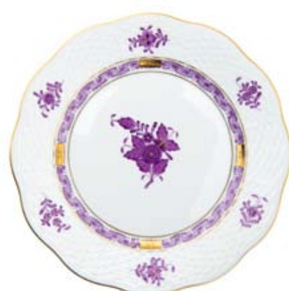
APPONYI LILAS (AL)