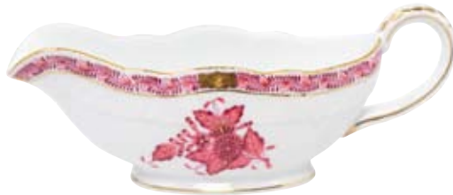
SAUCEBOAT (01218-0-00 AP)