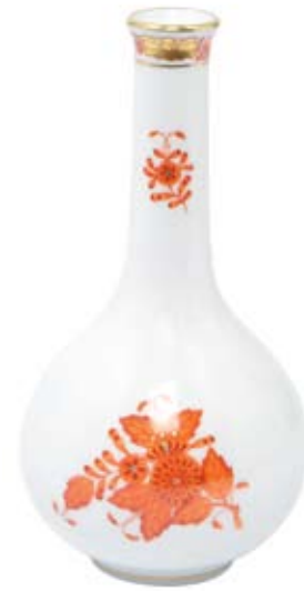
VASE (07104-0-00 AOG)