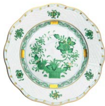
FLEURS DES INDES VERTES (FV)