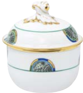
SUGAR BASIN, TWISTED KNOB (02463-0-06 MED)