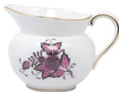
CREAMER (02642-0-00 CLOTP)