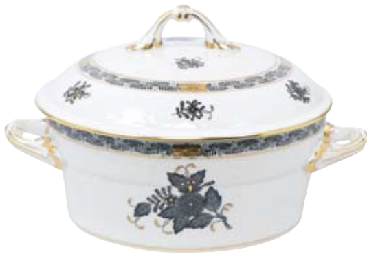
VEGETABLE DISH, STRAP KNOB (0000041-0-07 ANG)