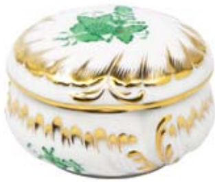
BONBONNIERE (06035-0-00 AV)