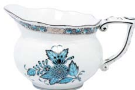
CREAMER (00642-0-00 ATQ3-PT)