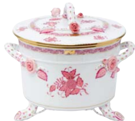
BISCUIT BOX, BRANCH KNOB (06300-0-02 AP)