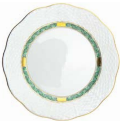
APPONYI VERT SIMPLE (ASV)