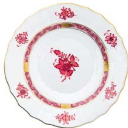
APPONYI MAUVE (AP2)