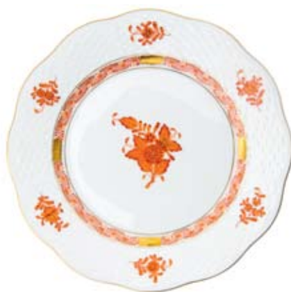
APPONYI ORANGE (AOG)