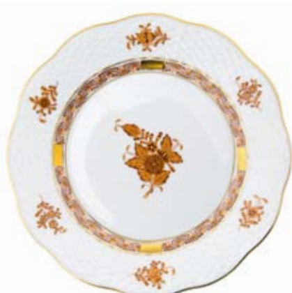
APPONYI MARRON (AM)