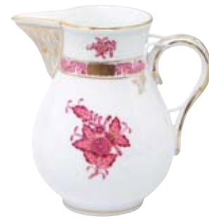
MILKJUG (01653-0-00 AP)