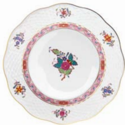
APPONYI FLEUR (AF)