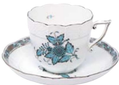
COFFEECUP WITH SAUCER (00642-0-00 ATQ3-PT)