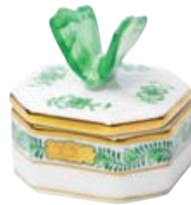
BONBONNIERE, BUTTERFLY KNOB (06105-0-17 AV)