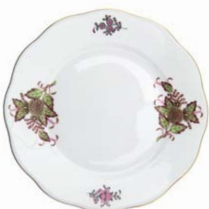
CLOTHILDE VERTE (CLOTV)