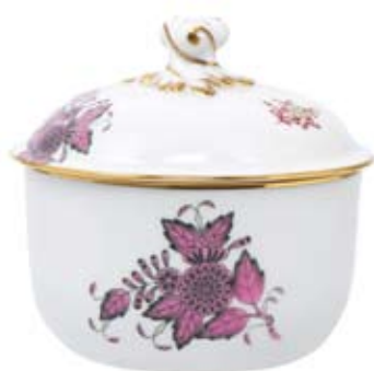
SUGARBASIN, TWISTED KNOB (20462-0-06 CLOTP)