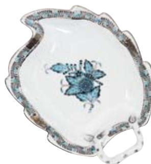
LEAF DISH (00205-0-00 ATQ3-PT)