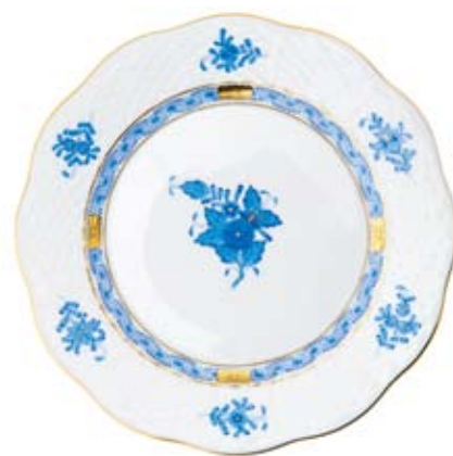
APPONYI BLEU (AB)