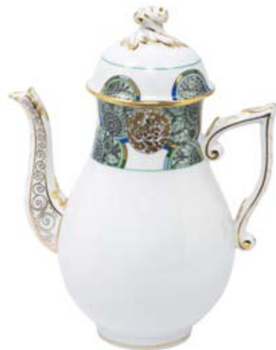
COFFEEPOT, TWISTED KNOB (20612-0-06 MED)