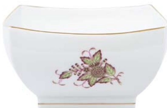
RECTANGULAR DISH, BIG (02185-0-00 CLOTV)