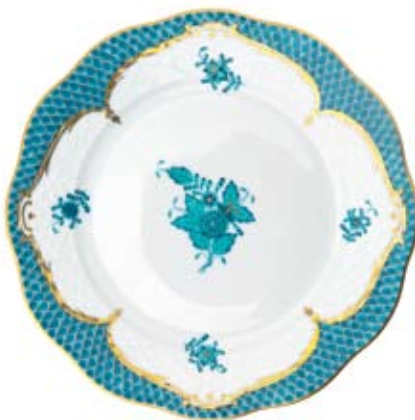
APPONYI TURQUOISE, ÉCAILLES TURQUOISES (ATQ-ETQ)