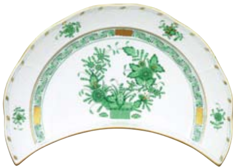
CRESCENT (00530-0-00 FV)