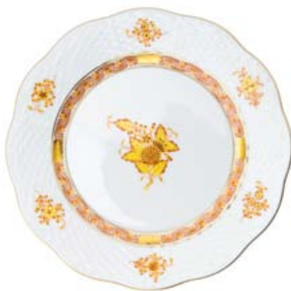
APPONYI JAUNE (AJ)