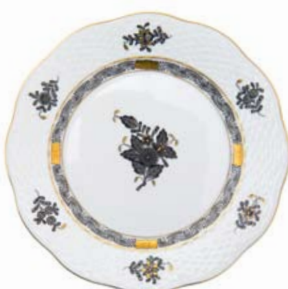
APPONYI GRIS (ANG)