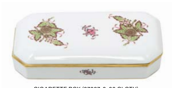
CIGARETTE BOX (07897-0-00 CLOTV)