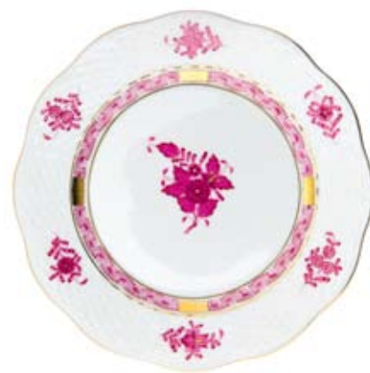
APPONYI POURPRE (AP)