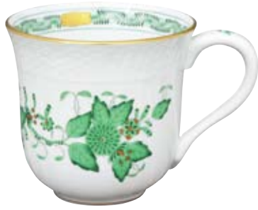
MILK MUG (01729-0-00 FV)