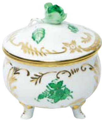
BONBONNIERE, ROSE KNOB (06040-0-09 AV)