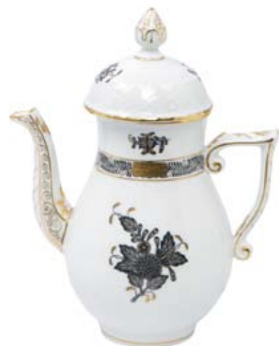
COFFEEPOT, ACANTHUS KNOB (00613-0-23 ANG)