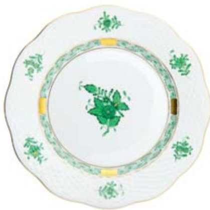
APPONYI VERT (AV)