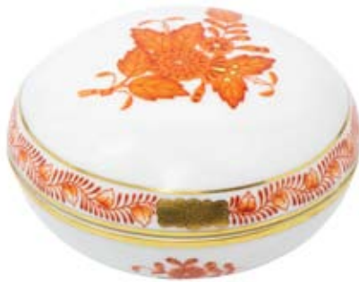
BONBONNIERE (06021-0-00 AOG)