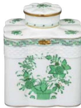
TEA CADDY (06376-0-00 FV)