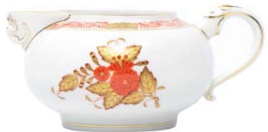
CREAMER (03443-0-00 APER-OR)