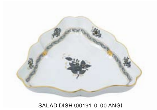
SALAD DISH (00191-0-00 ANG)