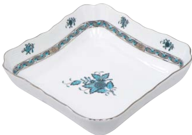
SALAD DISH (000181-0-00 ATQ3-PT)