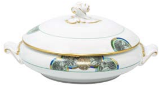
VEGETABLE DISH, TWISTED KNOB (02086-0-06 MED)