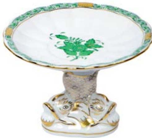
ORNAMENTAL CUP (07557-0-00 AV)