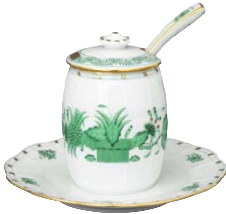
MUSTARD POT, BUTTON KNOB (00241-7-15 FV)