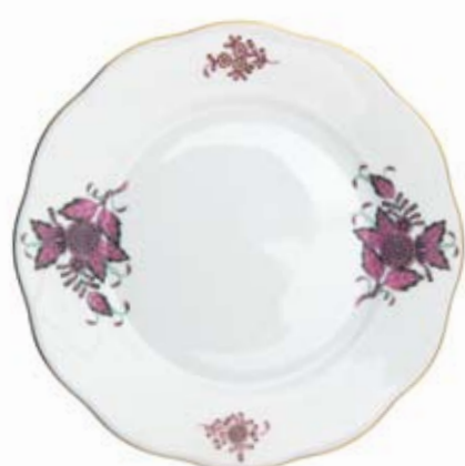
CLOTHILDE POURPRE (CLOTP)

Printed in Prospektus Printing House, Veszprém. Flowers in the photographs are courtesy ARIOS0 ( www.arioso.hu ).